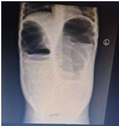
Figure 1: Abdominal x-ray showing significantly distended large bowel.

Baseline investigations, such as a complete blood count, serum electrolytes, and thyroid function tests, were all within normal limits. An abdominal X-ray revealed significantly dilated bowel loops with fecal loading (Fig 1). The barium enema revealed a transition zone in the proximal one-third of the rectum, with a reversed rectosigmoid ratio, which was suggestive of Hirschsprung's disease (Fig 2).